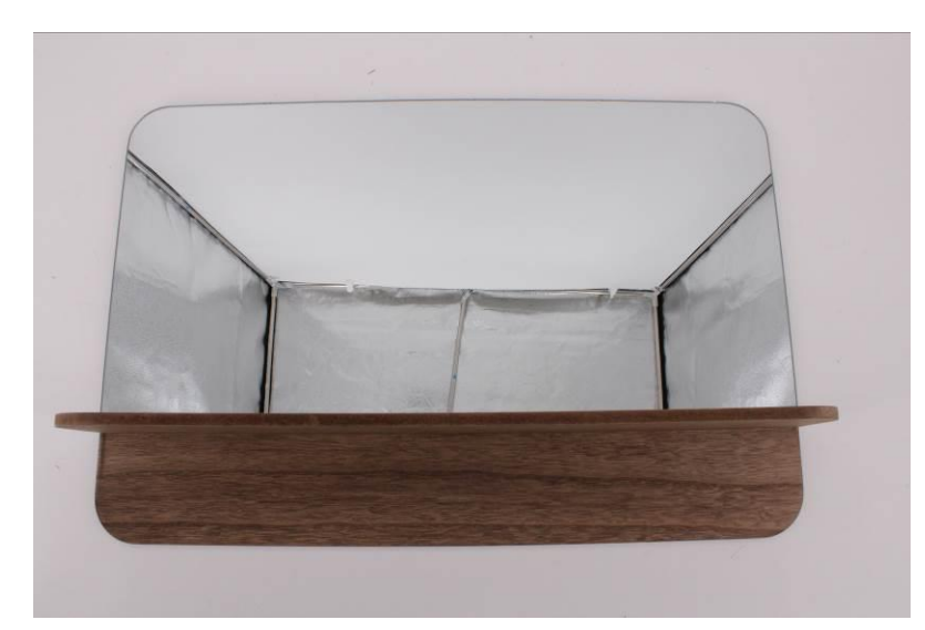
Size: 59.5x10x39.5 CM Composition = glass +MDF Weight: 2.70 kg

Finishing: Pls pay attention on dirts on the glass.